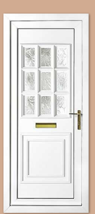
Cambridge One Georgian Bow Fronted Colour White Frame White