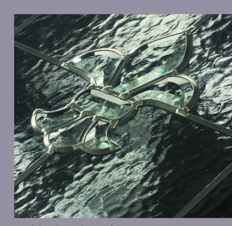
Astral Fleur de Lys Glass Detail