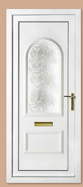
Rockingham One Patterned