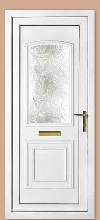
Balmoral One Classic Patterned Colour White Frame White