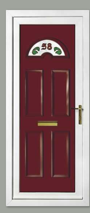
Sandringham One House Number Colour Red