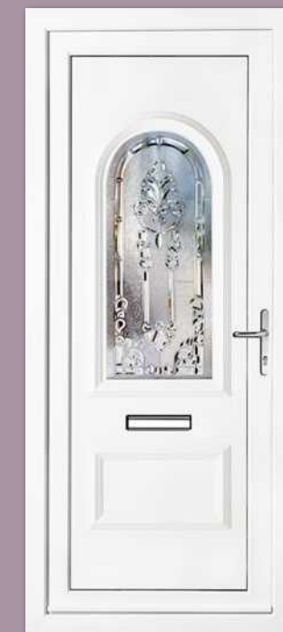
Rockingham One Crystal Aurora Clear Colour White Frame White