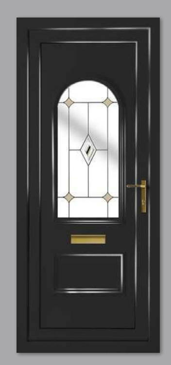
Rockingham One Fused Jewel Black/Beige