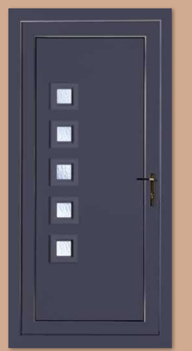
Malaga Five Patterned Colour Anthracite Grey Frame Anthracite Grey