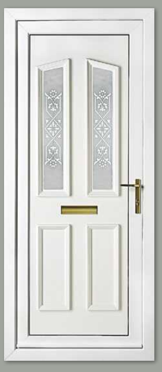
Kensington Two Sandblasted Diamond Flowers Colour White