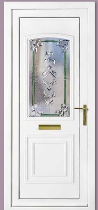
Balmoral One Classic Crystal Vega Green Colour White