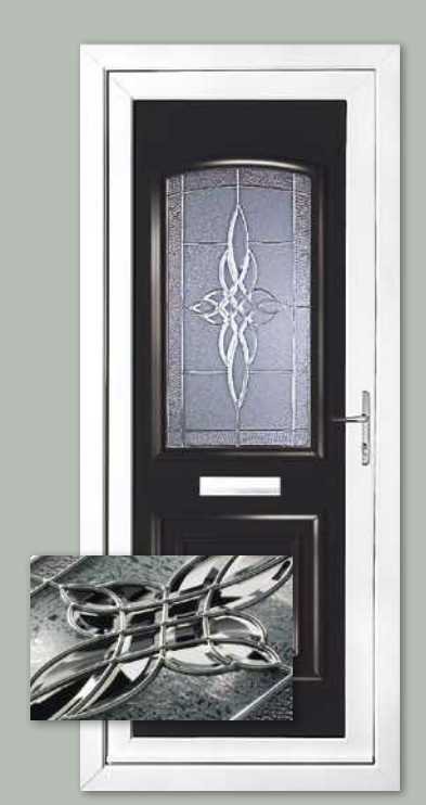
Balmoral One Classic Platinum Cluster Colour Black Brown