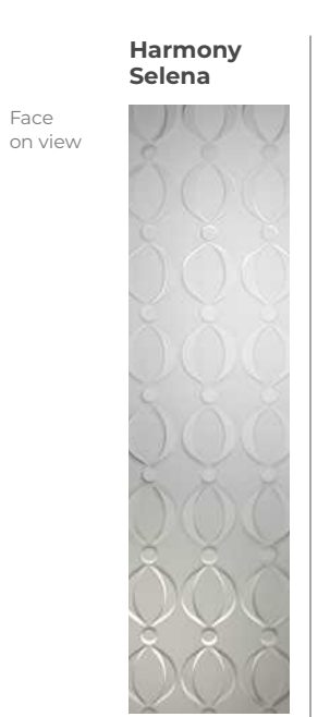
Angled view showing 3D effect