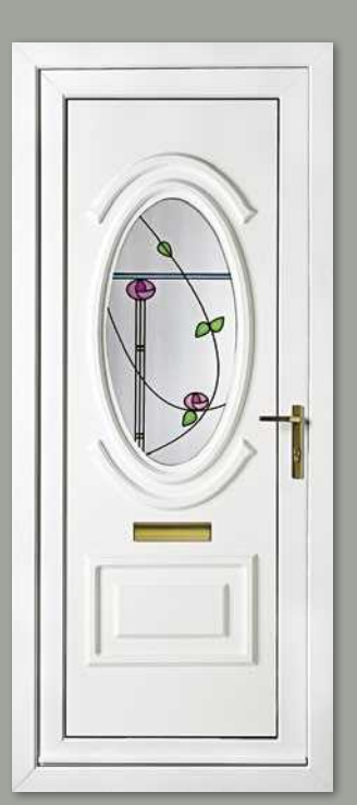
Richmond One Resin Tweed Colour White Frame White