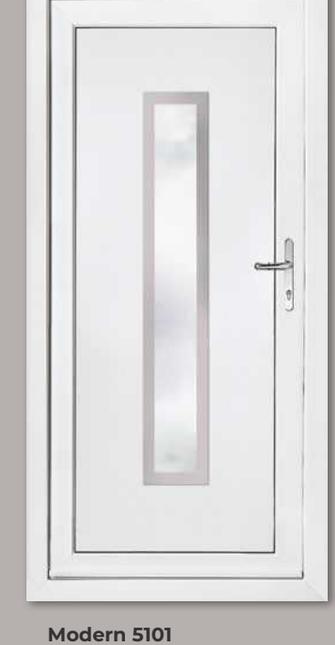
Colour White Frame White