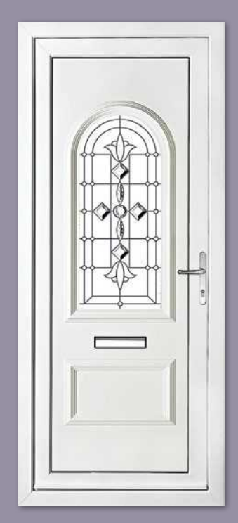
Rockingham One Ceramic Diamond Star