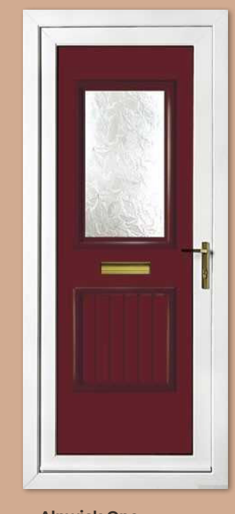
Alnwick One Patterned Colour Red Frame White