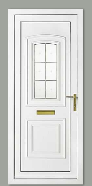
Balmoral One Sandblasted Miniature Stars Colour White Frame White