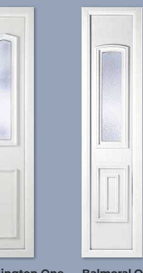
Balmoral One Classic Patterned Side Panel