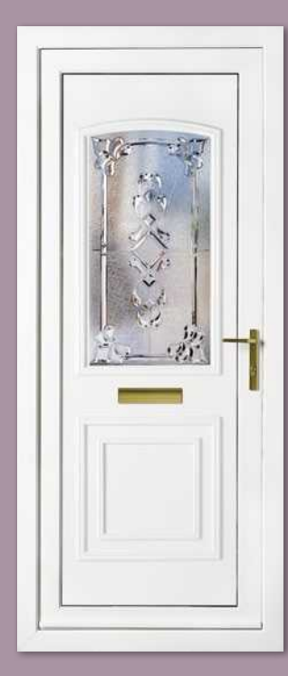
Balmoral One Classic Crystal Vega Clear Colour White