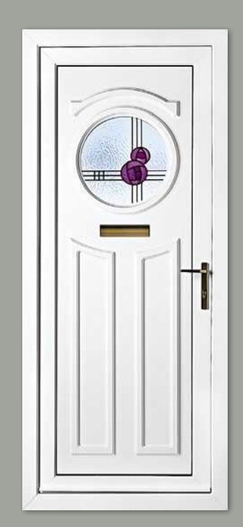
Blenheim One Resin Tay Colour White Frame White