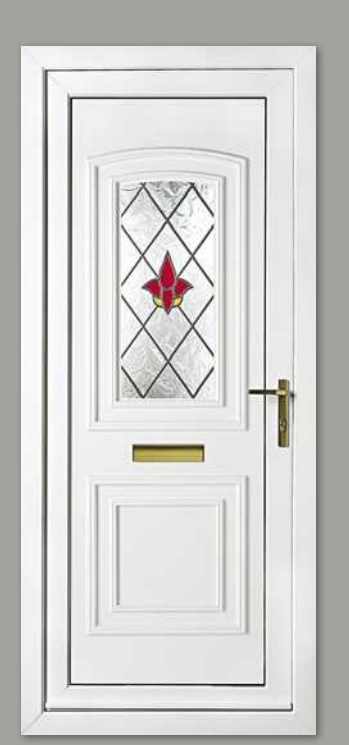
Balmoral One Red Campion Colour White Frame White