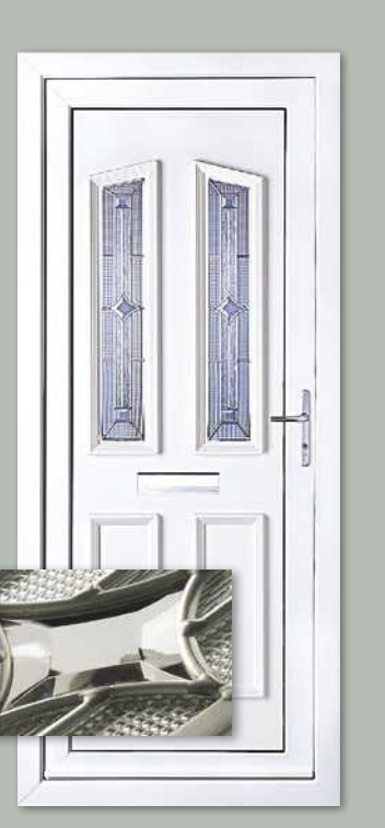
Kensington Two Platinum Legacy