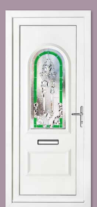
Rockingham One Crystal Aurora Green Colour White Frame White