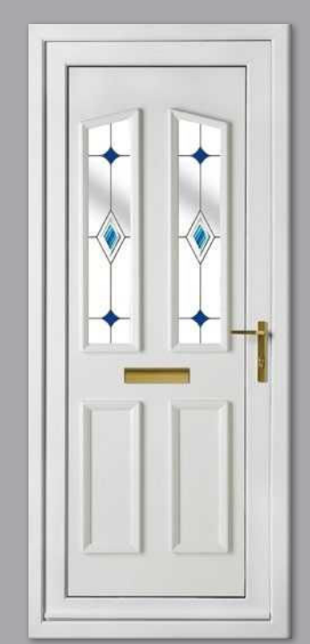
Kensington Two Fused Jewels Blue