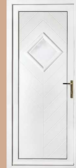
Hamburg One Patterned Colour White