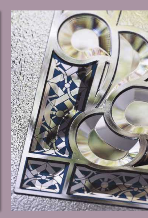
Crystal Aurora Cobalt Glass Detail

Rockingham One Crystal Aurora Blue Colour White Frame White