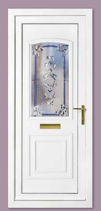
Balmoral One Classic Crystal Vega Blue Colour White Frame White