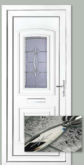
Balmoral One Platinum Pendant