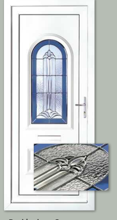
Rockingham One Platinum Fantasy Colour White