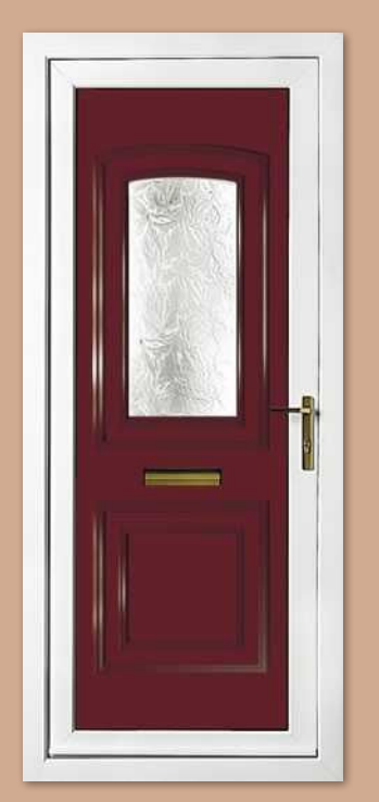
Balmoral One Patterned Colour Red