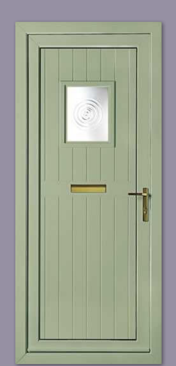
Chatsworth One Bullion