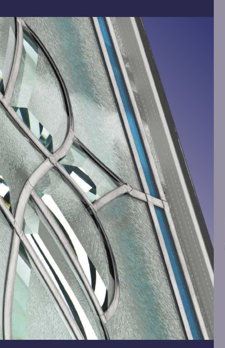
Kensington Two Astral Diamonds

The Bevel Collection features specially seamed and carefully cut bevels that are uniquely handcrafted onto clear and opaque glass. These panels provide privacy whilst maximising the natural light in your home.