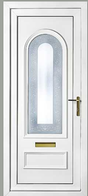
Canterbury One Sandblasted Border Colour White Frame White