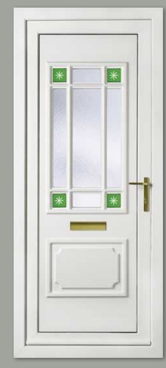
Seville One Corner Green Stars Colour White Frame White