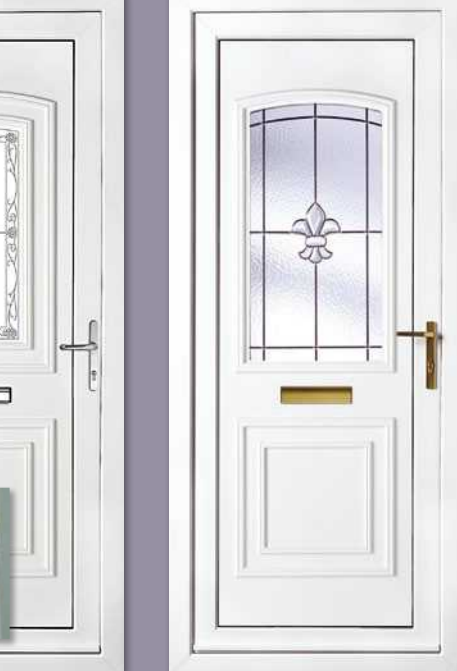
Balmoral One Ceramic Diamond Trio