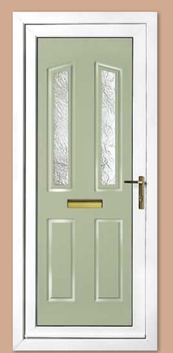
Kensington Two Inverted Patterned