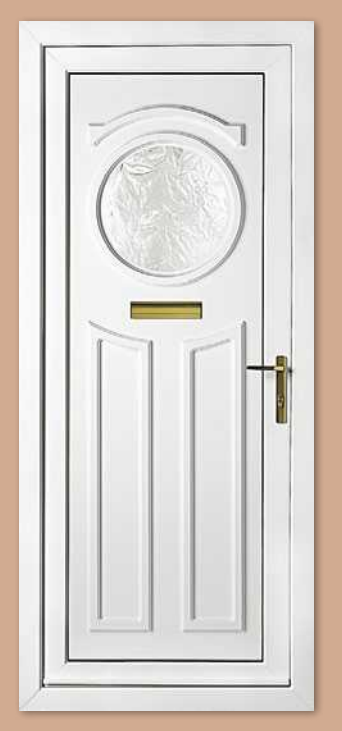
Blenheim One Patterned Colour White Frame White