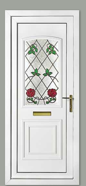
Balmoral One Classic Climbing Rose Colour White