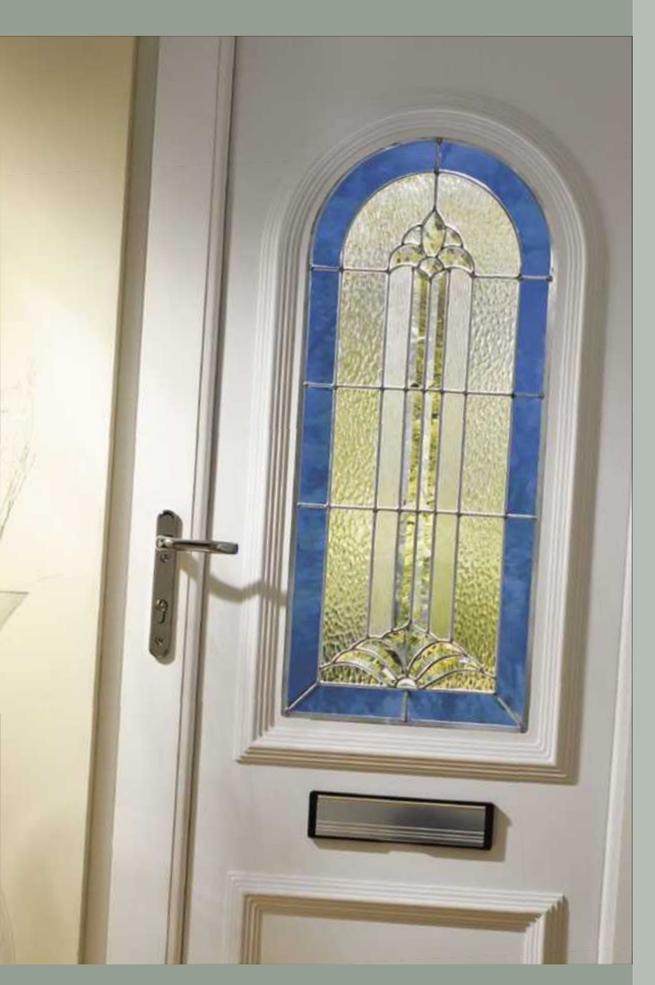
Rockingham One Platinum Fantasy Colour White

The Platinum Collection provides luxurious and exclusive designs that showcase glass bevels nestled between finely patterned backgrounds and platinum coloured soldered joint leadwork. These are then encased between two sheets of crystal clear glass for a unique, smooth to the touch, finish.