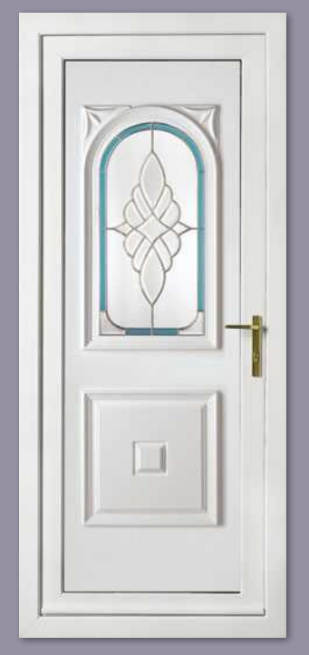
Reims One Diamond Cluster