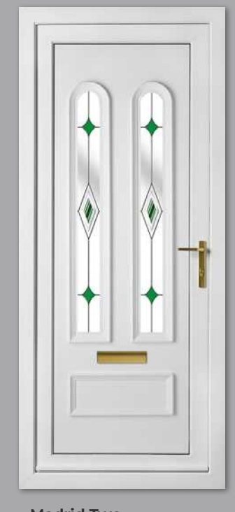
Madrid Two Fused Jewels Green