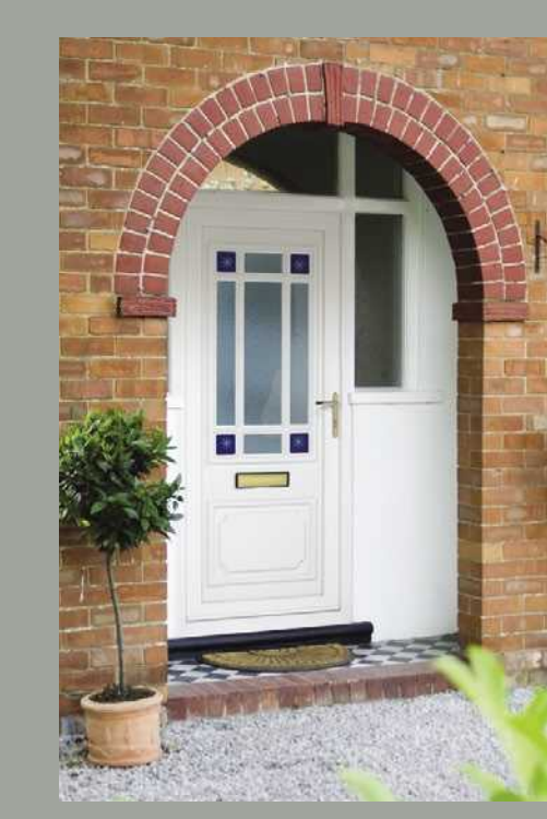
Seville One Corner Blue Stars Colour White Frame White