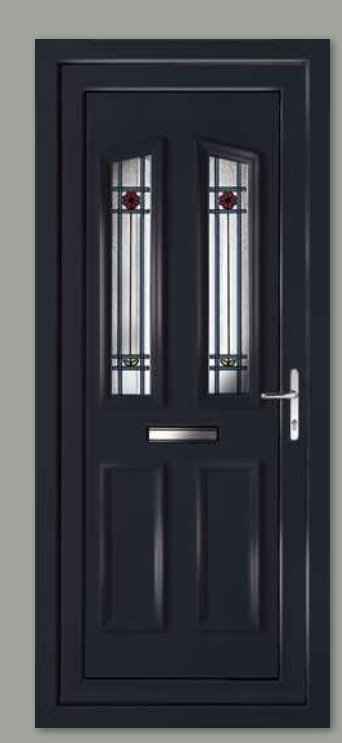
Kensington Two Resin Gerbera Colour Black Brown Frame Black Brown