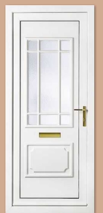
Seville One Patterned Colour White