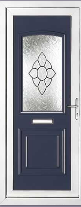
Balmoral One Classic Astral Opal