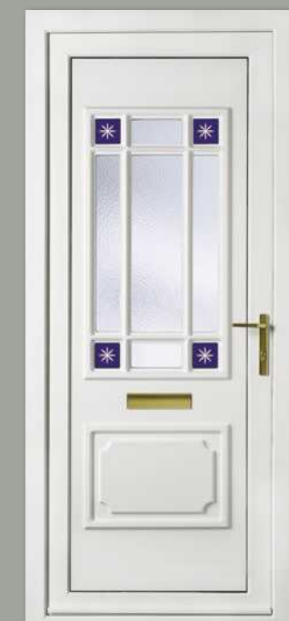
Seville One Corner Blue Stars Colour White