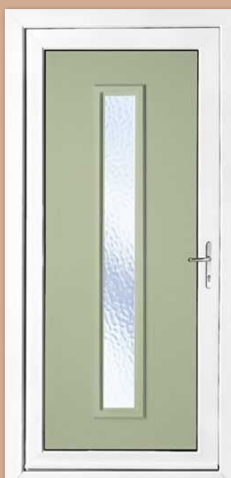
Rome One Patterned Colour Chartwell Green Frame White