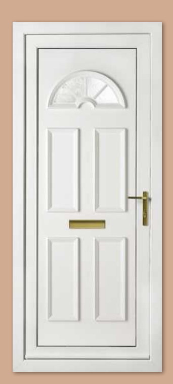
Sandringham One Georgian Bar Colour White Frame White