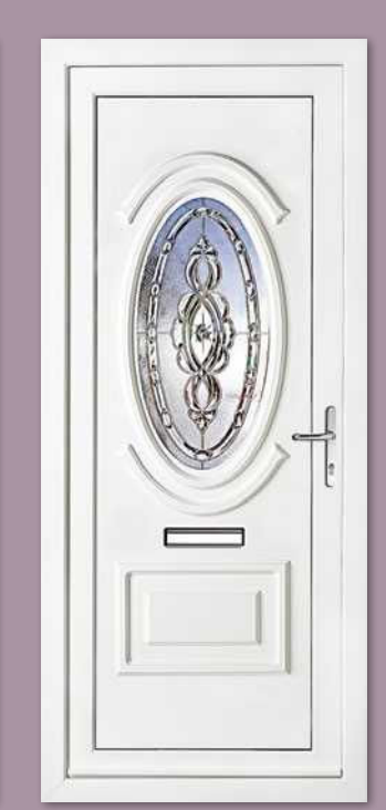
Richmond One Crystal Sirius Colour White Frame White