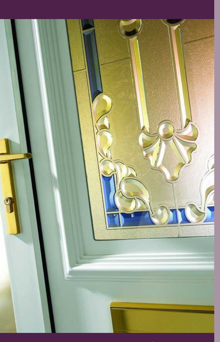
Madrid Two Crystal Tucana with Madrid One Crystal Tucana Side Panels Colour White

The Crystal Collection stylishly combines clear and coloured crystal designs with deep cut, clear resin bevels, set against a backdrop of intricate backing textures some with a splash of dynamic colour.