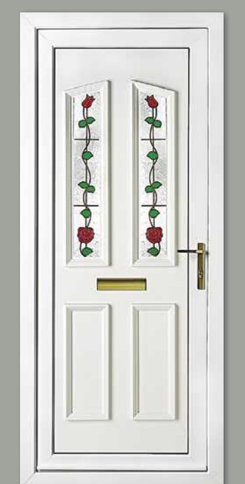
Kensington Two Climbing Rose Colour White Frame White