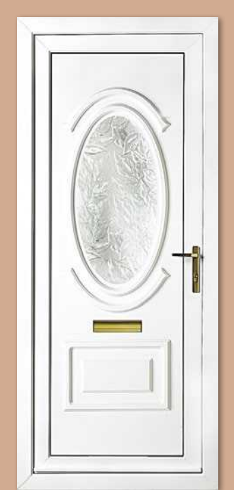
Richmond One Patterned Colour White Frame White