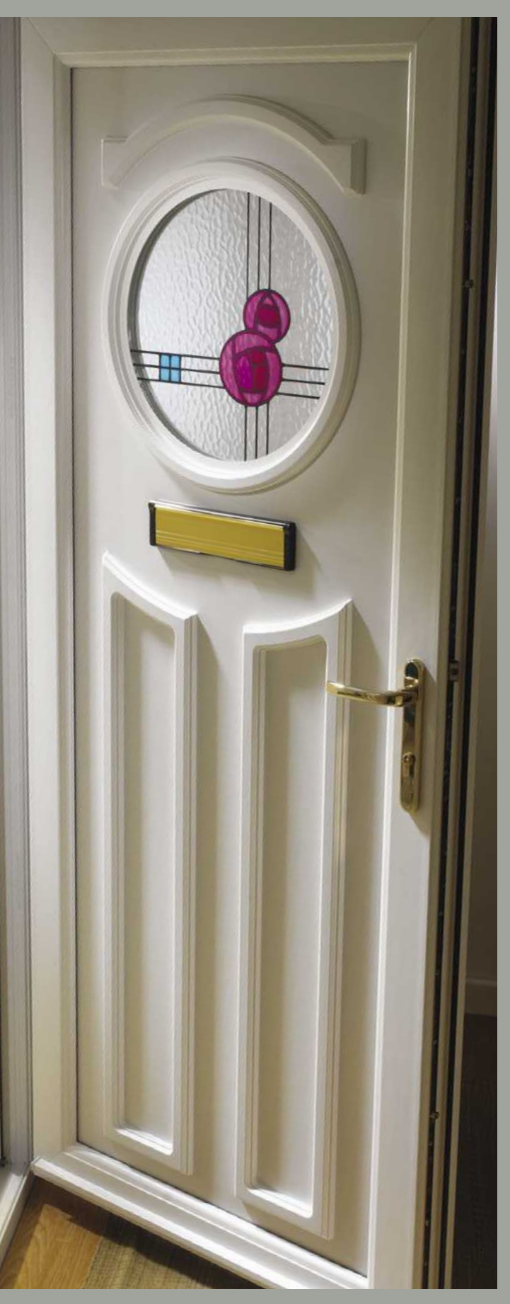
Blenheim One Resin Tay Colour White