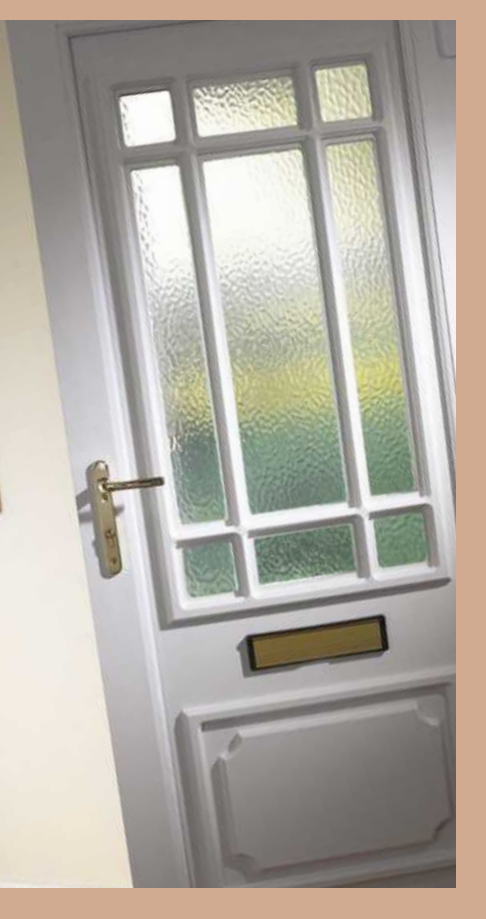
Seville One Patterned Colour White Frame White