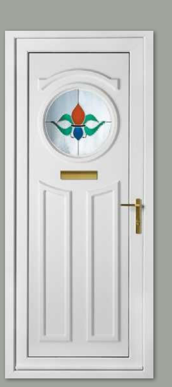
Blenheim One Resin Fleur De Lys Colour White