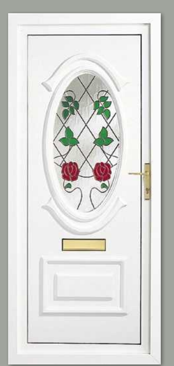
Richmond One Climbing Rose Colour White Frame White