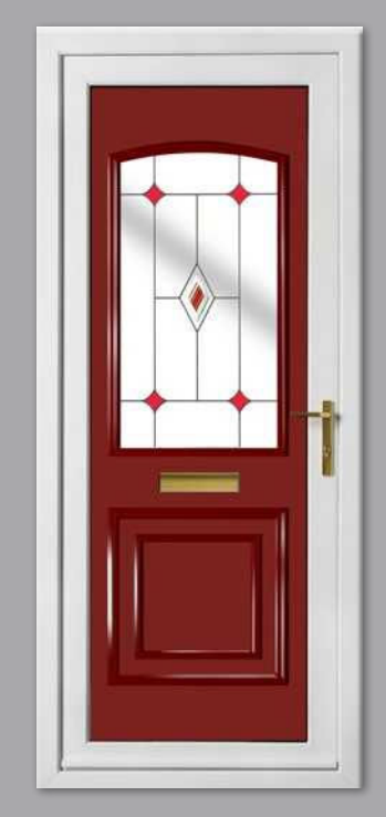
Balmoral One Classic Fused Jewel Red