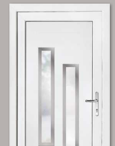
Modern 5082 Colour White