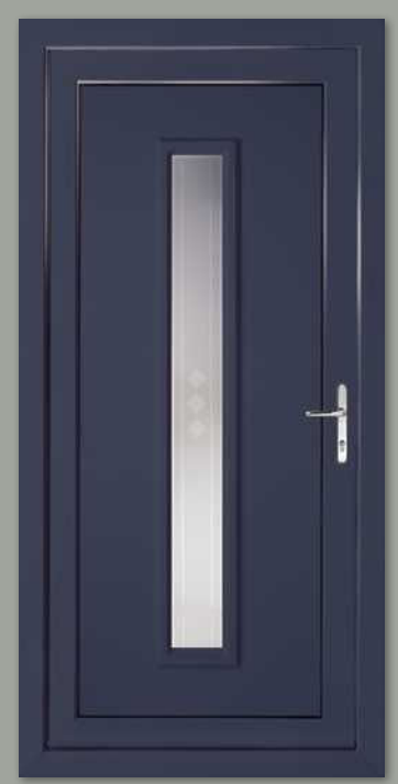
Sandblasted Diamond Colour Anthracite Grey Frame Anthracite Grey