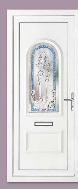
Rockingham One Crystal Aurora Cobalt Colour White