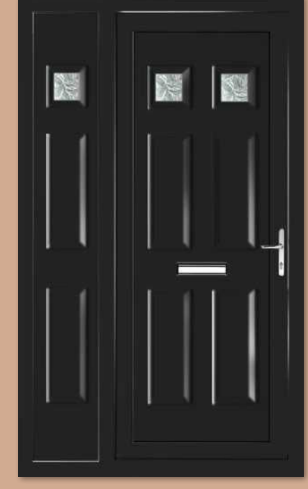
Windsor Two Patterned with Windsor One Patterned Side Panel