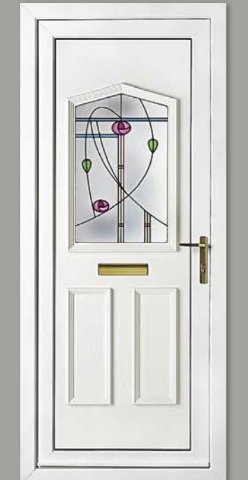
Oxford One Resin Forth Colour White Frame White