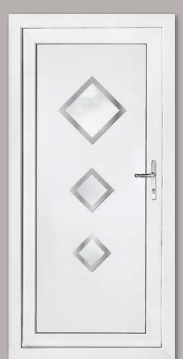
Modern 5123 Colour White