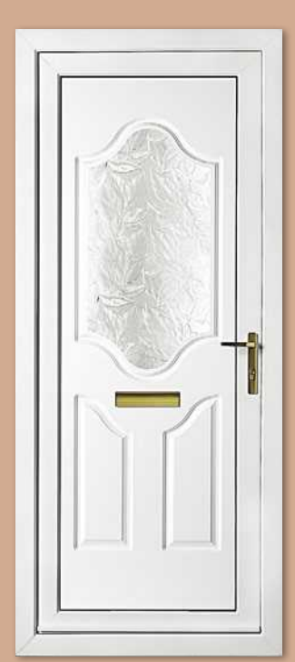
Althorpe One Inverted Patterned Colour White