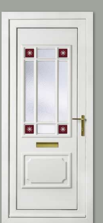
Seville One Corner Red Stars Colour White Frame White