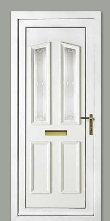
Kensington Two Sandblasted Edwardian Border Colour White