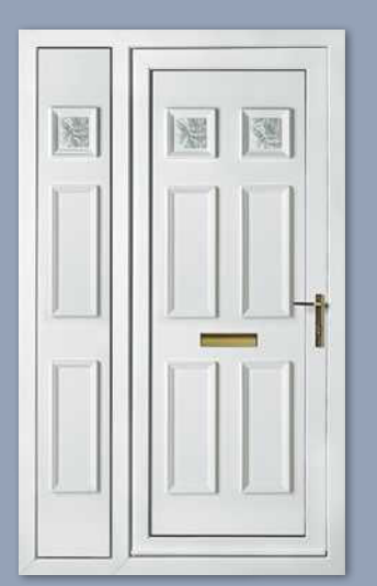
Windsor Two Patterned with Windsor One Patterned Side Panel

To enhance the entrance to your home, we offer an array of matching panels in a range of colours to complement your choice of door.