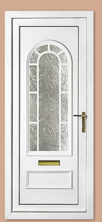
Canterbury One Arched Georgian Bar Colour White Frame White