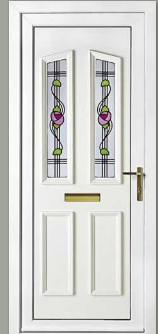
Kensington Two Resin Spey Colour White Frame White