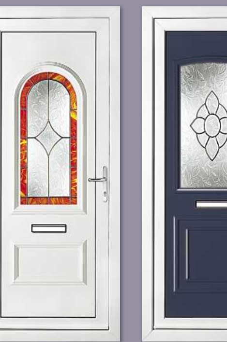
Rockingham One Astral Virgo