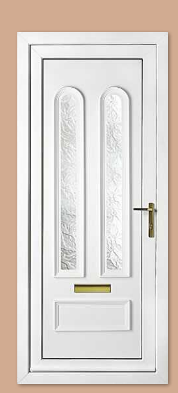
Madrid Two Patterned Colour White