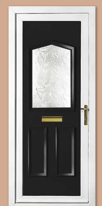
Oxford One Patterned Colour Black Brown Frame White