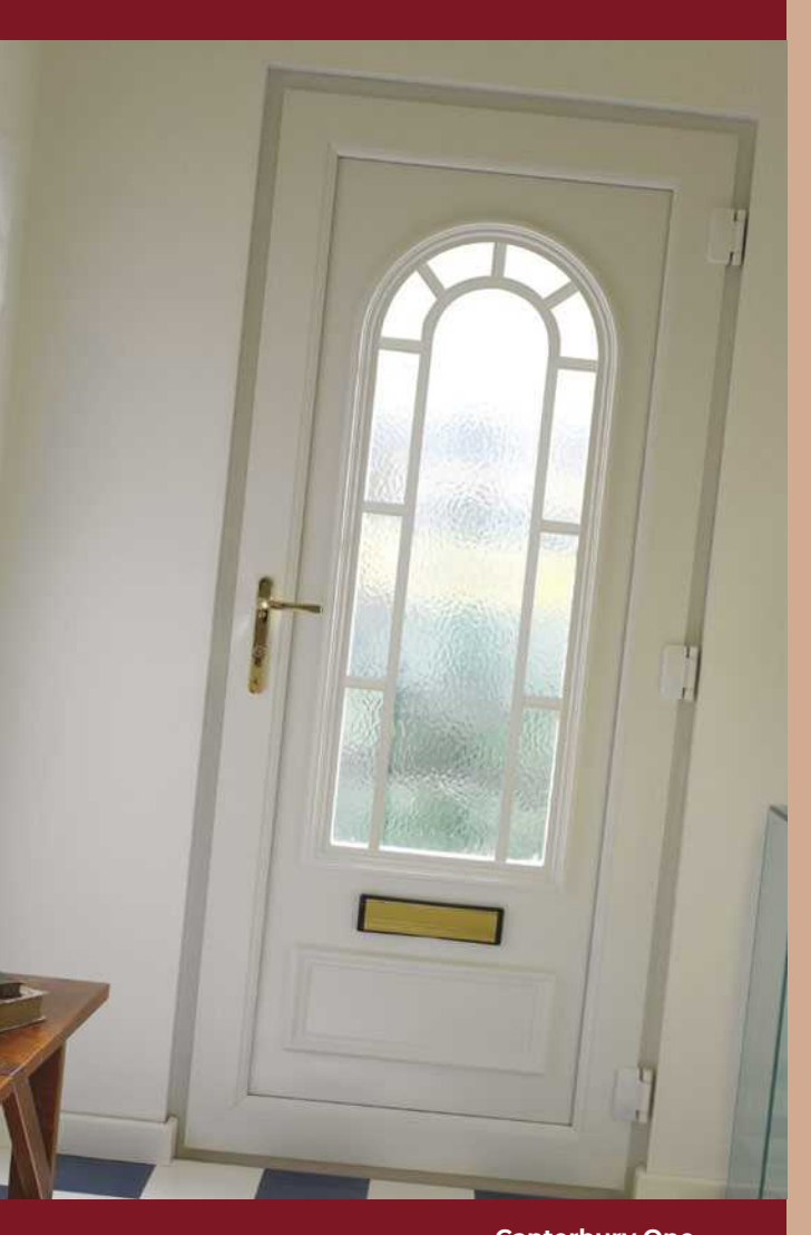
Canterbury One Arched Georgian Bar Colour White

The Classic Collection features timeless styles available in Clear, Diamond Lead and Georgian Bar glass designs, all enhanced with decorative patterned or clear backing glass options.