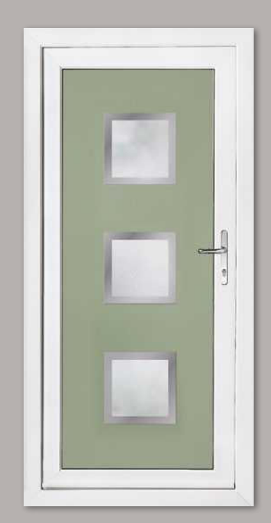
Modern 5013 Colour Chartwell Green Frame White