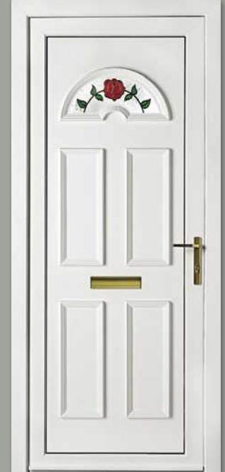
Sandringham One Climbing Rose Colour White Frame White