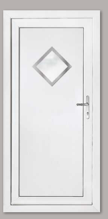
Modern 5131 Colour White