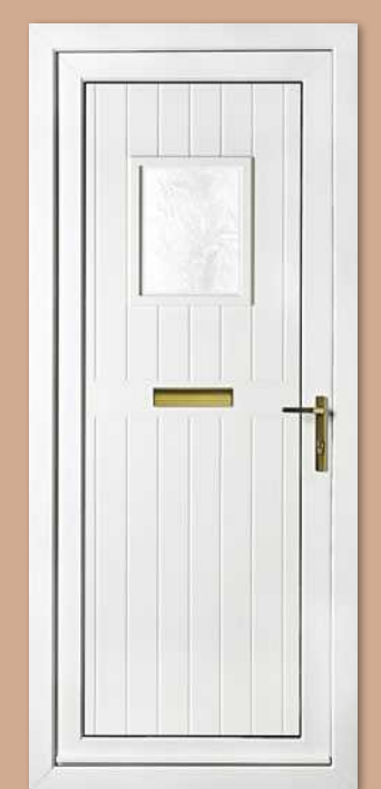
Chatsworth One Patterned Colour White Frame White